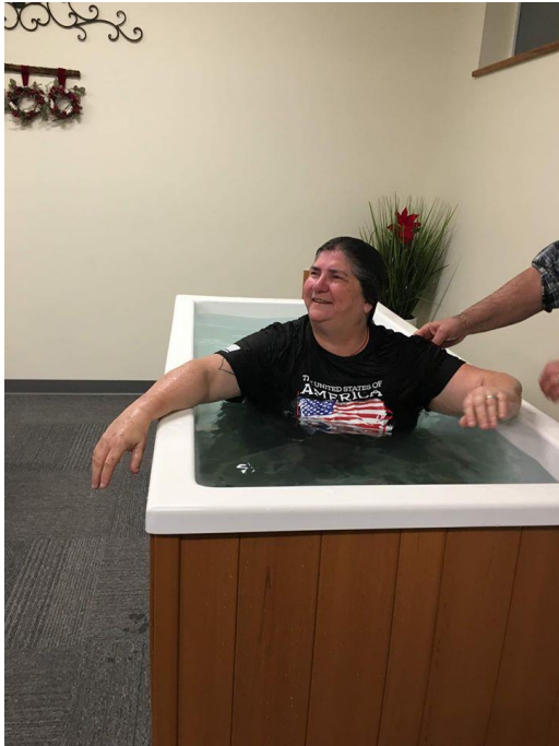
New sister in Christ in VT!