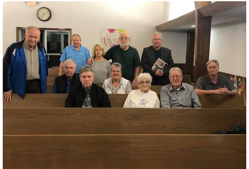
Members at Westwood (Paris TX) Church of Christ