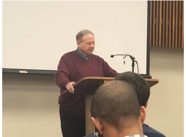
Teaching a class at Sunset Workshop.