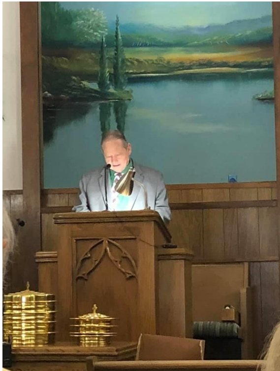
Bible class and preaching at Westwood (Paris TX)