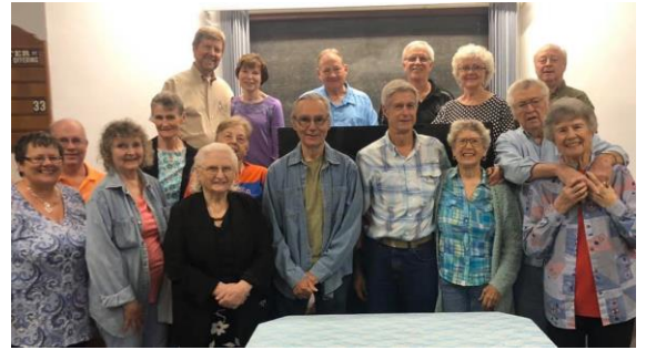
Members at Floral City (FL)