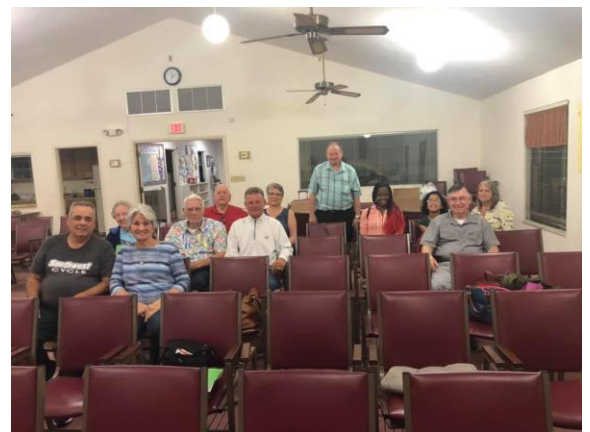
Members at Cape Coral (FL)