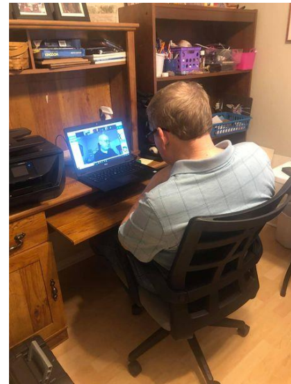
Thankful for modern technology, HomeMission has kept in communication with staff, evangelists, and congregations!