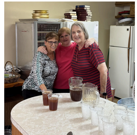
Kitchen generals at Cyril COC