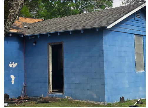
New roof in progress at North Side church of Christ, Athens, TX (Dwayne Hagemeier assisted).