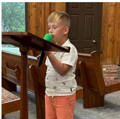
Youth leading singing Sunday afternoon at Caverns Road - 6 years old - "Jesus Loves Me."