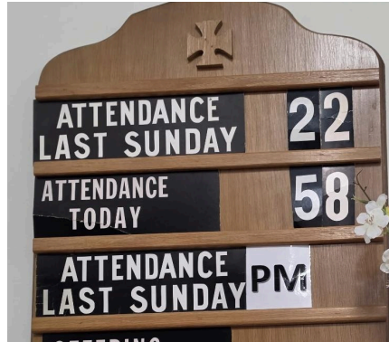
Attendance significantly increased at the Eagleville COC (Eagleville, TN) Friends and Family Day. Jack Skinner works with this congregation.