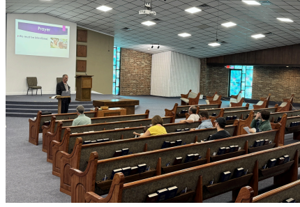
Day one of the LAUNCH Refresh at Avenue T COC (Temple, TX).